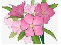
PHOTO GALLERY FROM THE KINDERGARTEN AND PRE-K EXTENDED DAY